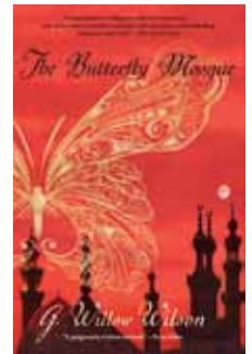
A 2012 Silicon Valley Reads Selection