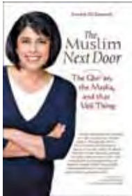
A 2012 Silicon Valley Reads Selection